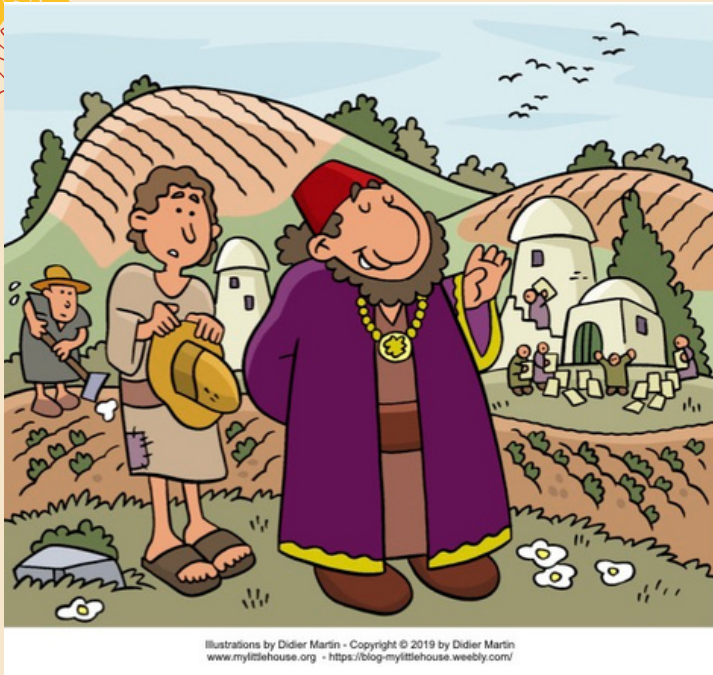
Illustrations by Didier Martin - Copyright © 2019 by Didier Martin www.mylittlehouse.org - https://blog-mylittlehouse.weebly.com/