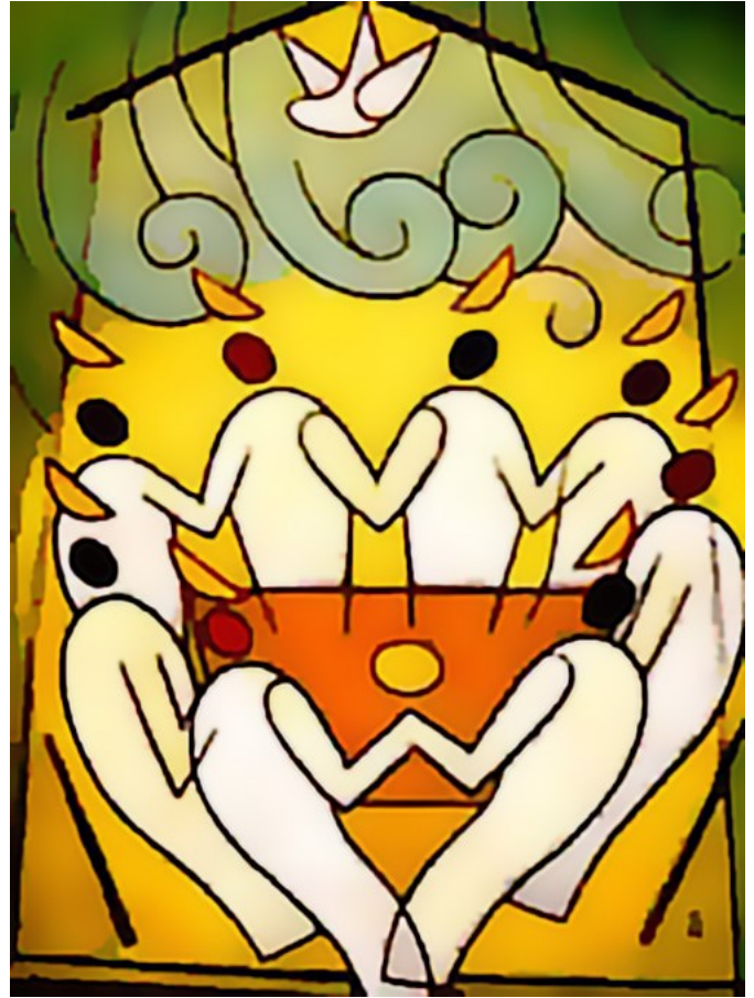
Soichi Watanabe (Japanese, 1949–) The Coming of the Holy Spirit, 1996. Oil on canvas