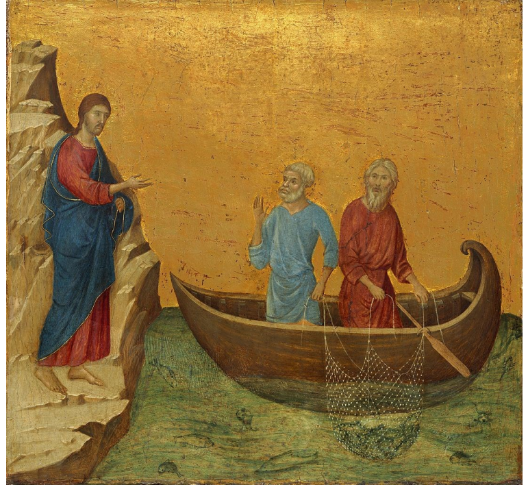
The Calling of Simon Peter and Andrew by Duccio