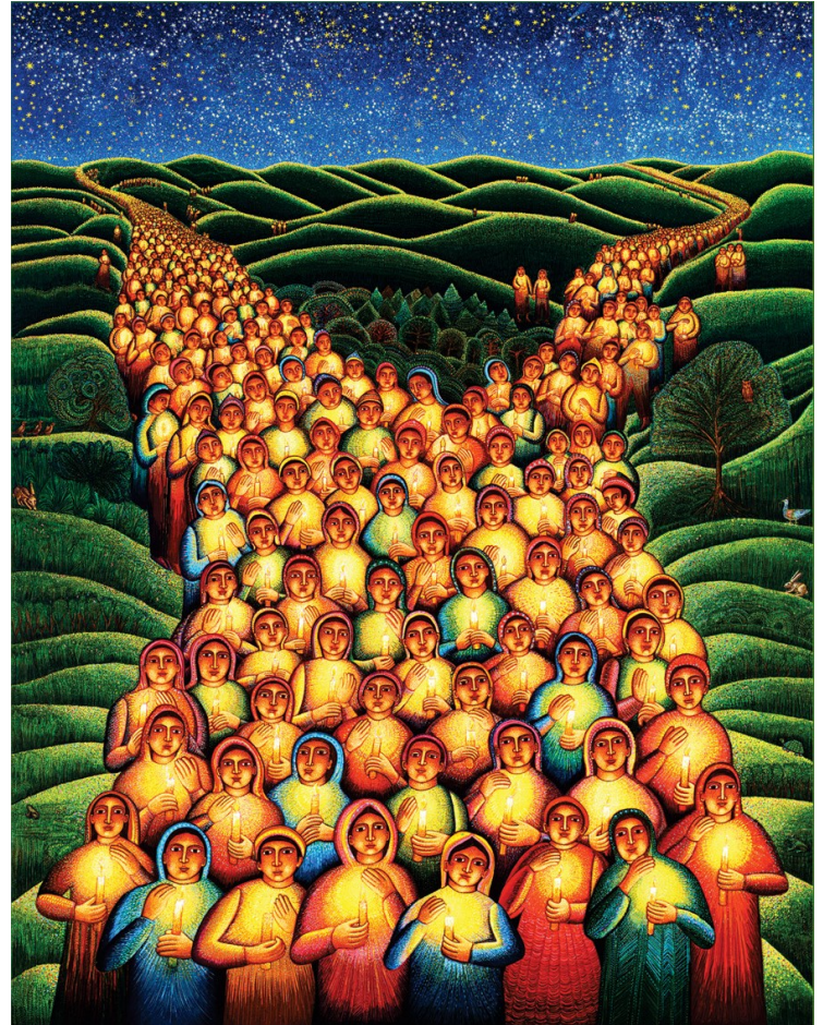
Festival of Lights

December 19: 9am Children's Pageant 11am Youth Pageant 3pm Longest Night Worship