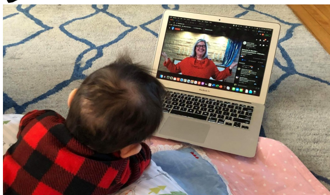
Online Worship is fun for all ages! Sundays at 9am https://facebook.com/cumethodist