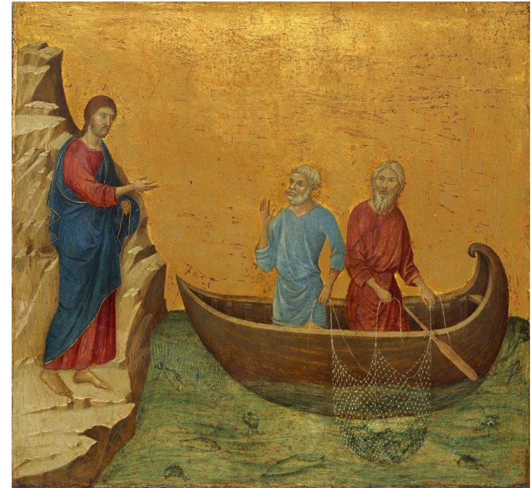
The Calling of Simon Peter and Andrew by Duccio

9:00am Traditions Worship ~ February 20, 2022