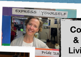
Community Care & Faith Sharing Living in authentic community and welcoming more and new people into community