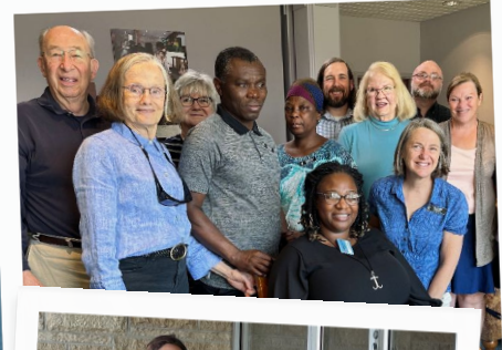
Worship & Music Celebrating God's love, welcome, and hope through weekly worship experiences