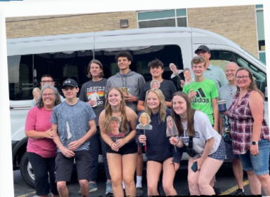
Mission & Outreach Sharing God's hope and grace by making a difference in the city and the world