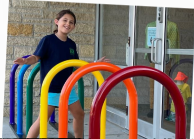
Faith to Life & Christian Education Nurturing and encouraging faith with programs and groups for all ages