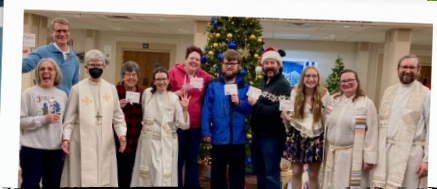
Leadership Development & Administration Supporting our mission by equipping leaders and maintaining our building