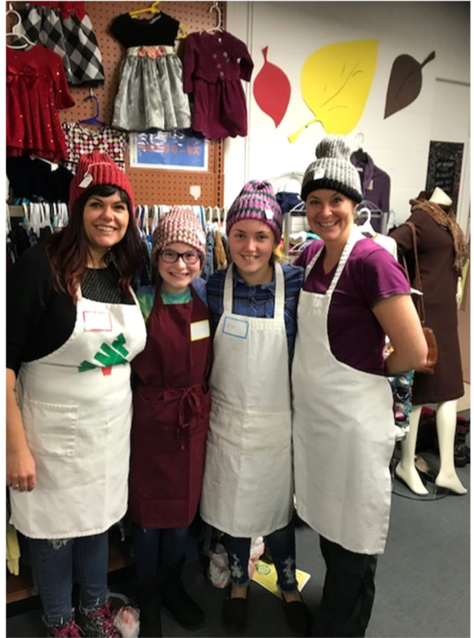
Saturday Noon Meal volunteers taking a little break at Thrift on Fifth. Hand knitted hats on sale as boutique items for $5 each.