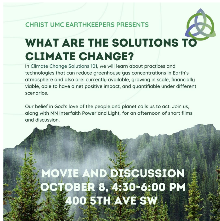
Earthkeepers event meets in the ECC

Socketober We're supporting the Rochester Community Warming Center this month with donations of new tube and winter socks, pump bottles, and travel size shampoo, conditioner and body wash. The orange pumpkin Socketober container will be in the Commons through October 29 to receive your donations.