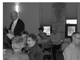
IHN Annual Meeting